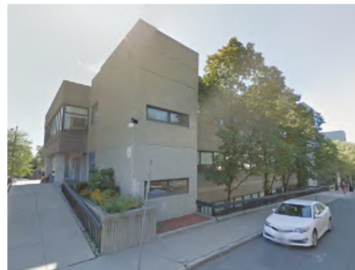
11 WINTER HILL COMMUNITY SCHOOL 115 SYCAMORE ST, SOMERVILLE, MA 02145