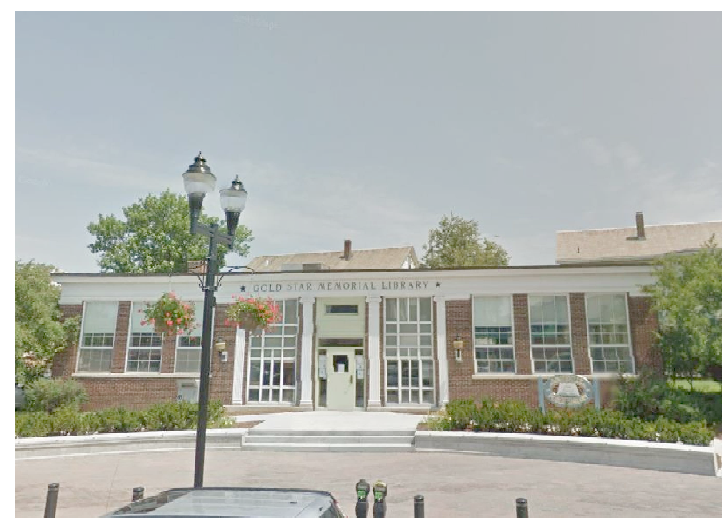
2 SOMERVILLE EAST BRANCH PUBLIC LIBRARY 115 BROADWAY, SOMERVILLE, MA 02145