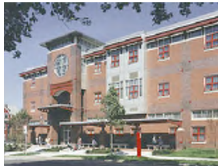
9 WEST SOMERVILLE NEIGHBORHOOD SCHOOL 177 POWDER HOUSE BLVD, SOMERVILLE, MA 02144