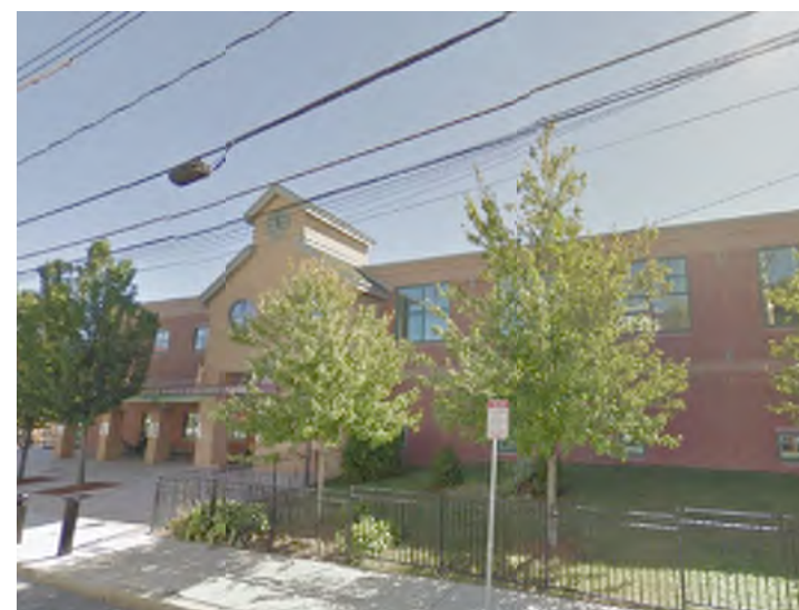
5 MICHAEL E. CAPUANO SCHOOL 150 GLEN ST, SOMERVILLE, MA 02145