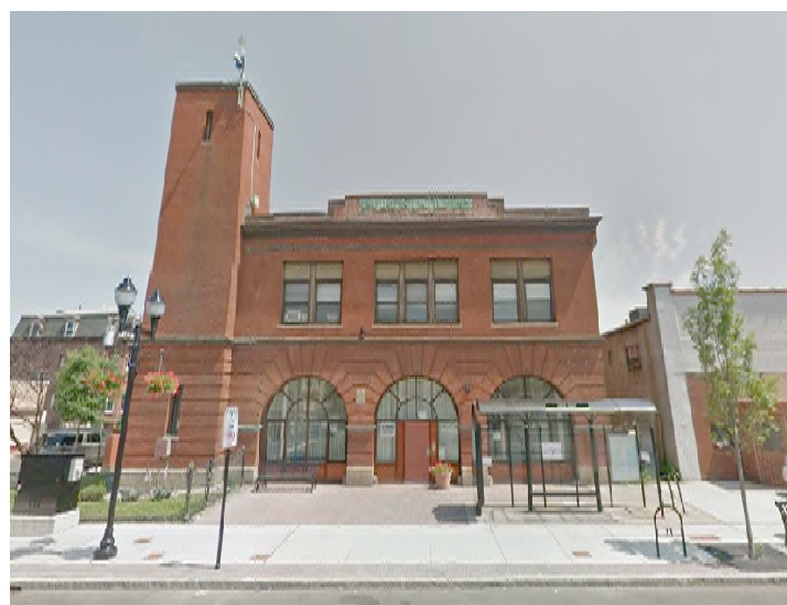
3 SOMERVILLE CROSS STREET CENTER 165 BROADWAY, SOMERVILLE, MA 02145