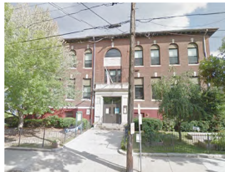
10 BENJAMIN G. BROWN SCHOOL 201 WILLOW AVE, SOMERVILLE, MA 02144