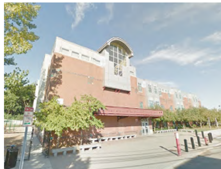
6 ARTHUR D. HEALEY SCHOOL 5 MEACHAM ST, SOMERVILLE, MA 02145