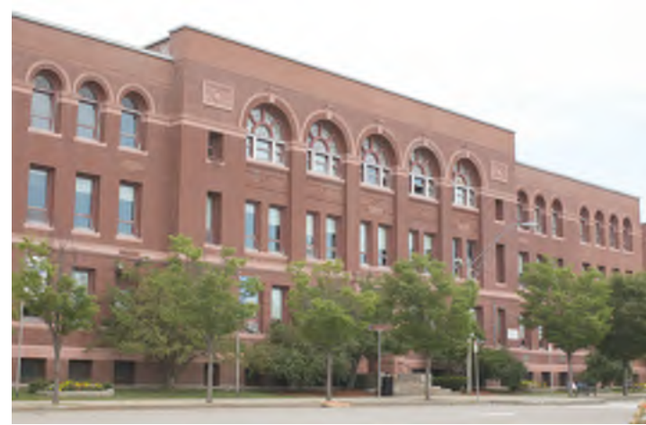
7 SOMERVILLE HIGH SCHOOL 81 HIGHLAND AVE, SOMERVILLE, MA 02143