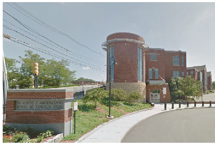
4 DR. ALBERT F. ARGENZIANO SCHOOL 290 WASHINGTON ST, SOMERVILLE, MA 02143