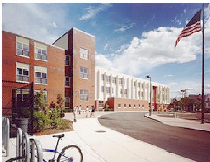
8 JOHN F. KENNEDY ELEMENTARY SCHOOL 7 CHERRY ST, SOMERVILLE, MASSACHUSETTS