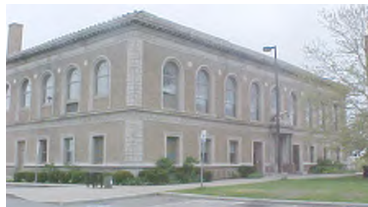
1 SOMERVILLE CENTRAL PUBLIC LIBRARY 79 HIGHLAND AVE, SOMERVILLE, MA 02143